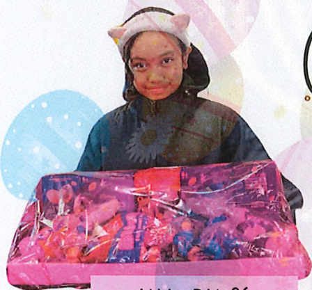
MIA RM 26